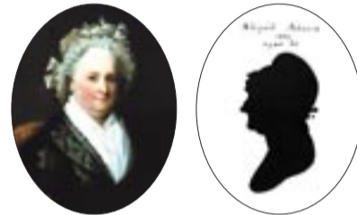
Martha Washington (above left) by an unidentified artist, after Gilbert Stuart and Charles Willson Peale, oil on canvas, 1800–1825. Abigail Adams (above right) by Raphaelle Peale, hollow-cut silhouette, 1804. National Portrait Gallery, Smithsonian Institution

—a suggested title for the President of the United States, 1789