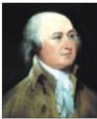
John Adams by John Trumbull (detail), oil on canvas, circa 1793. National Portrait Gallery, Smithsonian Institution

WHAT IS THE PRESIDENT TO BE CALLED? Debate, we are told, rages behind the closed doors of the Senate over a proper title for the President. Vice President John Adams and a number of the senators have insisted that a grand and high-sounding name, such as “Elective Excellency” or “Elective Highness,” is necessary to give respect to the office. Sources tell us that the committee appointed to draw up a list of titles “of all the Princes of the Earth” has recommended “His Highness the President of the United States of America, and Protector of their Liberties.” But the House of Representatives refuses to agree, and Mr. Washington will be simply called President of the United States. As one member of Congress told us, no other title was necessary to add to the respect the