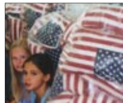
Lots of patriotic pillows!