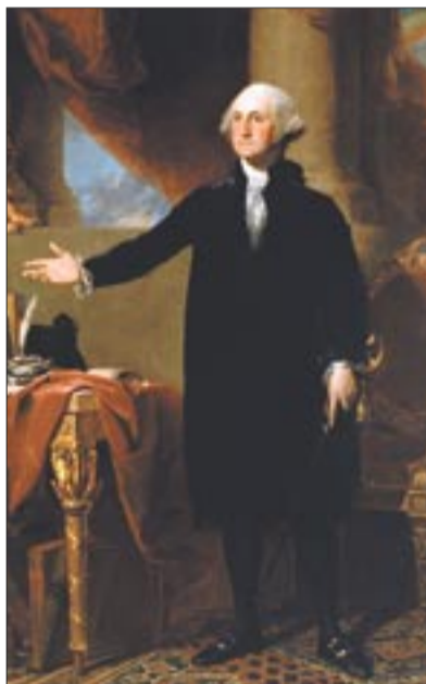
The National Portrait Gallery, Smithsonian Institution, acquired Gilbert Stuart's 1796 Lansdowne portrait of George Washington in 2001 as a gift to the nation through the generosity of the Donald W. Reynolds Foundation.