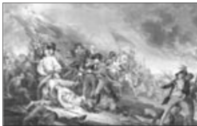
Battle of Bunker Hill, near Boston (detail) by Johann Gotthard Von Müller, after John Trumbull, engraving, 1788–1797.

"December 14—Prisoners & Deserters are continually coming in. The Army which has been surprisingly healthy hitherto, now begins to grow sickly from the continued fatigues they have suffered this Campaign. Yet they still show a spirit of Alacrity & Contentment not to be expected from so young Troops. I am Sick—discontented—and out of humour. Poor food—hard lodging—Cold Weather—fatigue—Nasty Cloaths—nasty Cookery—Vomit half my time—Smoak'd out of my senses [by the smoke created by the guns]—the Devil's in it—I can't Endure it—Why are we sent here to starve and Freeze—What sweet Felicities have I left at home; A charming Wife—pretty Children—Good Beds—good food—good Cookery—All agreeable—all harmonious. Here all Confusion—smoke & Cold—hunger & filthiness—a pox on my bad luck. There comes a bowl of beef soup—full of burnt leaves and dirt. . . . Away with it Boys—I'll live like the Chameleon upon Air. Poh! Poh! Cries Patience within me—you talk like a fool. Your being Covers your mind with a Melancholic Gloom, which makes everything about you appear gloomy. See the poor Soldier, when in health—with