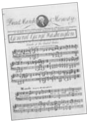
"Death March and Monody," sheet music, circa 1799-1800.

MRS. WASHINGTON'S DRAWING ROOM. On Friday evening at eight, your humble correspondent was among the ladies and gentlemen in attendance at Mrs. Washington's weekly reception. Mrs. Washington, plainly dressed, but in a gown of rich silk, sat on a sofa by the fireplace and arose to greet her guests with a curtsy which each lady returned. Each gentleman bowed low. Coffee, tea, and cake were served, and had I come in the summer, I would have been offered lemonade and ice cream. The ladies swish about, and as candlelight is a great improver of beauty, they appear to great advantage. President Washington circulated among the crowd, chatting agreeably with all the ladies. It is said that he keeps count of the numbers who come to pay their respects to Mrs. Washington and was pleased to find the room so crowded.