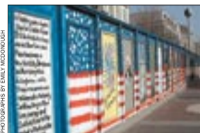
Dedicated to those who sacrificed and served on September 11, 2001, and the weeks following, the Wall of Expression surrounds the Old Patent Office Building at 8th and F Streets in Washington, D.C. The building, home of the National Portrait Gallery and the Smithsonian American Art Museum, is currently undergoing extensive renovation while its collections tour the world.

THOMAS PAINE, FROM The American Crisis , DECEMBER 1776