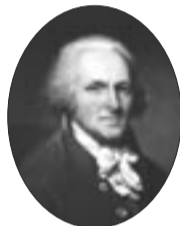
Charles Wilson Peale, self-portrait, oil on canvas, circa 1791. National Portrait Gallery, Smithsonian Institution