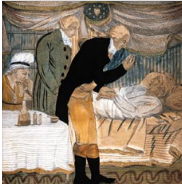
George Washington in His Last Illness, an etching done in 1800 by an unidentified artist, is an example of the public's fascination with the death of its first American hero.

During his whole illness he spoke but seldom, and with great difficulty; and in so low and broken a voice as at times hardly to be understood. His patience, fortitude, and resignation