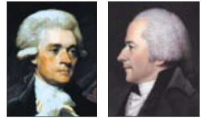
Thomas Jefferson (above left) by Mather Brown (detail), oil on canvas, 1786. Gift of Charles Francis Adams. Alexander Hamilton (above right) by James Sharples, pastel on paper, circa 1796. National Portrait Gallery, Smithsonian Institution

WHERE IS THE CAPITAL TO BE? Ever since the old Congress left Philadelphia in 1783, arguments have raged over where the permanent seat of government should be built. At last, the residence is decided. The government is to leave New York and spend the next ten years in Philadelphia. The permanent capital will be a new city created on the banks of the Potomac River, the exact location to be chosen by President Washington. Some folks speculate that it will not be far from Mount Vernon. New Yorkers, after they have gone to so much trouble and expense to accommodate the government, feel betrayed, and one angry letter to the editor speaks of the President as the country’s “former favorite guardian and deliverer.”