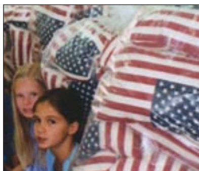
Lots of patriotic pillows!