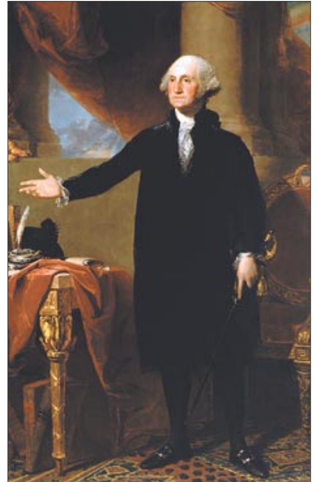
The National Portrait Gallery, Smithsonian Institution, acquired Gilbert Stuart's 1796 Lansdowne portrait of George Washington in 2001 as a gift to the nation through the generosity of the Donald W. Reynolds Foundation.