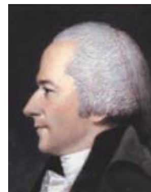
Thomas Jefferson (above left) by Mather Brown (detail), oil on canvas, 1786. Gift of Charles Francis Adams. Alexander Hamilton (above right) by James Sharples, pastel on paper, circa 1796. National Portrait Gallery, Smithsonian Institution