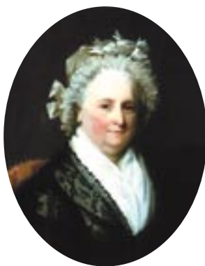
Martha Washington (above left) by an unidentified artist, after Gilbert Stuart and Charles Willson Peale, oil on canvas, 1800-1825. Abigail Adams (above right) by Raphaelle Peale, hollow-cut silhouette, 1804.

—a suggested title for the President of the United States, 1789