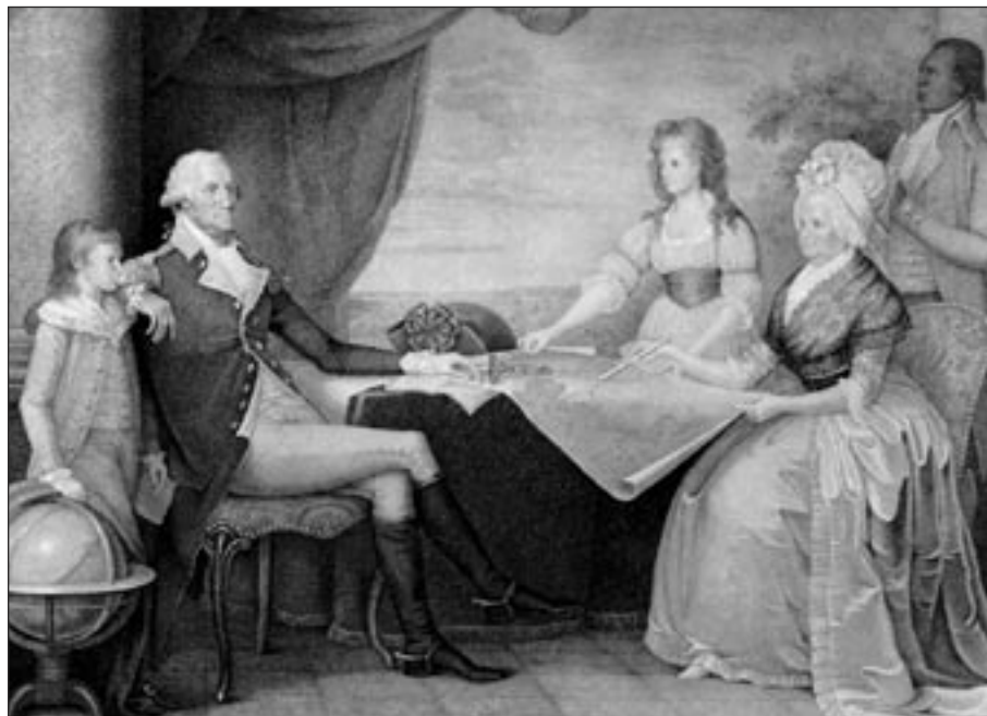
George Washington and His Family by David Edwin, after Edward Savage, stipple engraving, 1798. National Portrait Gallery, Smithsonian Institution

PRESIDENTIAL RESIDENCE, 190 HIGH STREET, PHILADELPHIA. Senator Robert Morris’s dwelling, at 190 High Street, has turned out to be the best house available for the President’s use, and Mr. Morris has graciously agreed to move around the corner. Additions will be made to accommodate Mrs. Washington and her two grandchildren, Nelly, who is about twelve, and George Washington, who is about ten, as well as the President’s secretary and numerous servants. The bathing room has been turned into a study to provide for a room in which the President can do business, but unfortunately it will be necessary for visitors to walk up two flights of stairs and pass by the public rooms and private chambers to get to it. The President has insisted that the house is to be finished in a plain and neat manner and has ruled out tapestry or very rich and costly wallpaper. He has also ruled that the back yard be kept as clean as the parlor, since it is in full view from the best rooms in the house.