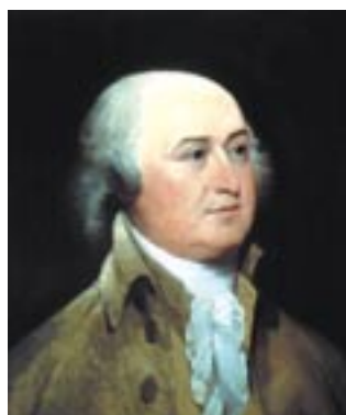
John Adams by John Trumbull (detail), oil on canvas, circa 1793. National Portrait Gallery, Smithsonian Institution

WHAT IS THE PRESIDENT TO BE CALLED? Debate, we are told, rages behind the closed doors of the Senate over a proper title for the President. Vice President John Adams and a number of the senators have insisted that a grand and high-sounding name, such as “Elective Excellency” or “Elective Highness,” is necessary to give respect to the office. Sources tell us that the committee appointed to draw up a list of titles “of all the Princes of the Earth” has recommended “His Highness the President of the United States of America, and Protector of their Liberties.” But the House of Representatives refuses to agree, and Mr. Washington will be simply called President of the United States. As one member of Congress told us, no other title was necessary to add to the respect the whole country had for General Washington.