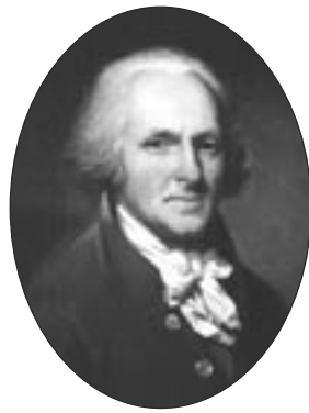
Charles Willson Peale, self-portrait, oil on canvas, circa 1791. National Portrait Gallery, Smithsonian Institution