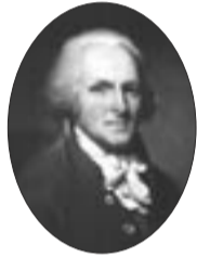
Charles Wilson Peale, self-portrait, oil on canvas, circa 1791. National Portrait Gallery, Smithsonian Institution

PEALE'S MUSEUM. A visit to Mr. Peale's museum, Prudence Pudding tells us, is well worth the admission fee of one fourth of a dollar, if only to see the huge American buffalo. Peale's rooms are filled with monsters of the earth and sea, a rich array of birds, and a great collection of the bones, jaws, and teeth of tigers, sharks, and many other fearful animals. In one room are rattle, black, and spotted snakes, confined in cases enclosed with wire and glass. She was astonished to see Mr. Peale take out a black snake about four or five feet long which he permitted to touch his cheek and twine itself around his neck. In the yard and stable were eagles, owls, baboons, monkeys, and a six-footed cow. Mr. Peale is also a painter, and there can be seen in his museum more than a hundred portraits of the more noteworthy personages of our country, including our illustrious Washington.