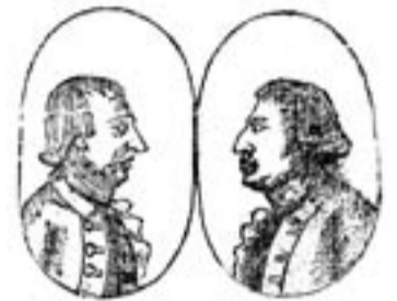
The Glorious Washington and Gates , detail from Bickerstaff's Boston Almanack, 1778