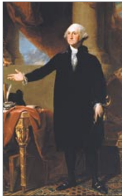
The National Portrait Gallery, Smithsonian Institution, acquired Gilbert Stuart’s 1796 Lansdowne portrait of George Washington in 2001 as a gift to the nation through the generosity of the Donald W. Reynolds Foundation.