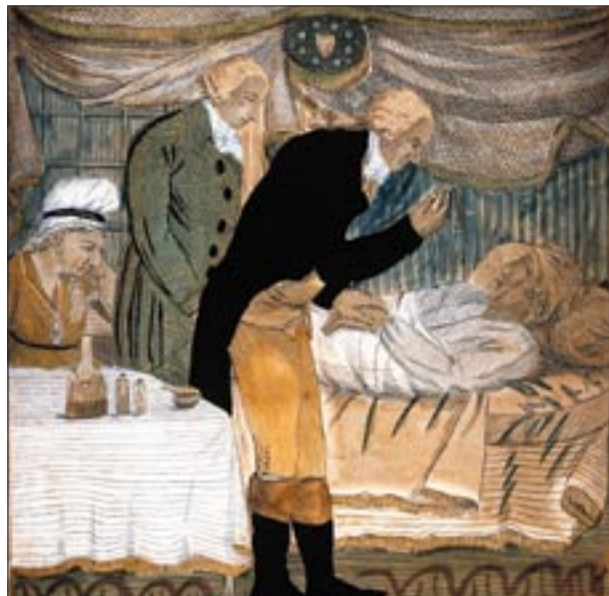
George Washington in His Last Illness, an etching done in 1800 by an unidentified artist, is an example of the public's fascination with the death of its first American hero.

An elaborate funeral is planned for Wednesday, December 18, including gun salutes and a procession.