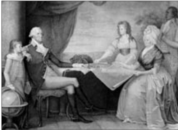
George Washington and His Family by David Edwin, after Edward Savage, stipple engraving, 1798. National Portrait Gallery, Smithsonian Institution

PRESIDENTIAL RESIDENCE, 190 HIGH STREET, PHILADELPHIA. Senator Robert Morris's dwelling, at 190 High Street, has turned out to be the best house available for the President's use, and Mr. Morris has graciously agreed to move around the corner. Additions will be made to accommodate Mrs. Washington and her two grandchildren, Nelly, who is about twelve, and George Washington, who is about ten, as well as the President's secretary and numerous servants. The bathing room has been turned into a study to provide for a room in which the President can do business, but unfortunately it will be necessary for visitors to walk up two flights of stairs and pass by the public rooms and private chambers to get to it. The President has insisted that the house is to be finished in a plain and neat manner and has ruled out tapestry or very rich and costly wallpaper. He has also ruled that the backyard be kept as clean as the parlor, since it is in full view from the best rooms in the house.