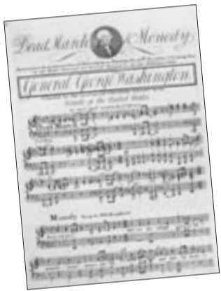
"Death March and Monody," sheet music, circa 1799-1800.

MRS. WASHINGTON'S DRAWING ROOM. On Friday evening at eight, your humble correspondent was among the ladies and gentlemen in attendance at Mrs. Washington's weekly reception. Mrs. Washington, plainly dressed, but in a gown of rich silk, sat on a sofa by the fireplace and arose to greet her guests with a curtsy which each lady returned. Each gentleman bowed low. Coffee, tea, and cake were served, and had I come in the summer, I would have been offered lemonade and ice cream. The ladies swish about, and as candlelight is a great improver of beauty, they appear to great advantage. President Washington circulated among the crowd, chatting agreeably with all the ladies. It is said that he keeps count of the numbers who come to pay their respects to Mrs. Washington and was pleased to find the room so crowded.