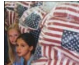
Lots of patriotic pillows!