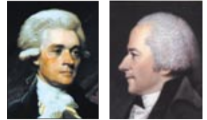
Thomas Jefferson (above left) by Mather Brown (detail), oil on canvas, 1786. Gift of Charles Francis Adams. Alexander Hamilton (above right) by James Sharples, pasted on paper, circa 1796.

*Editor’s note—We apologize in advance for any improprieties, insults, or slanderous remarks on the part of our correspondents. They are, at times ill-mannered, sometimes indiscreet, and, at all times, want of wit.