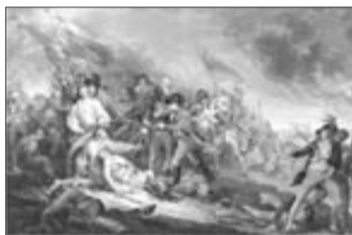
Battle of Bunker Hill, near Boston (detail) by Johann Gotthard Von Müller, after John Trumbull, engraving, 1788–1797.

VALLEY FORGE, 1777–1778—General Washington struggles to keep his troops alive and well in Valley Forge, Pennsylvania, this winter. Inadequate shipments of food, clothing, and supplies have left the regiments in shambles. Poor hygiene and serious disease threaten the lives of all the soldiers camped there. General Washington has appealed for more supplies, but has not been successful. In the meantime, General Washington struggles alongside his men, while his political enemies threaten to remove his power. Some critics feel that others are better suited to lead the Continental army.