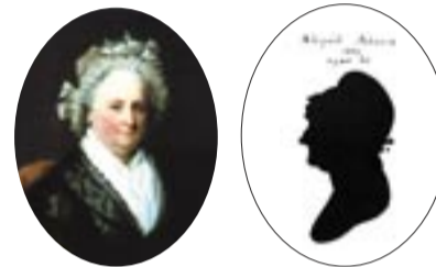
Martha Washington (above left) by an unidentified artist, after Gilbert Stuart and Charles Wilson Peale, oil on canvas, 1800-1825. Abigail Adams (above right) by Raphaelle Peale, hollow-cut silhouette, 1804.

HE COMES! HE COMES! George Washington, President-elect of the United States, has just set foot on the New York shore after an eight-day triumphal journey from Mount Vernon. The excitement here is unbelievable. Thousands line the streets—all you can see are heads standing as thick as ears of corn before the harvest. Ladies are crowded in every window, anxious for a glimpse of the illustrious man. “I have seen him!” we heard one young lady call out, “and though I had been entirely ignorant that he was arrived in the city, I should have known at a glance that it was General Washington: I never saw a human being that looked so great and noble as he does. I could fall down on my knees before him.” Washington, it can well be believed, is more popular than the new government he is to head.