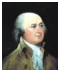
John Adams by John Trumbull (detail), oil on canvas, circa 1793. National Portrait Gallery, Smithsonian Institution

WHAT IS THE PRESIDENT TO BE CALLED? Debate, we are told, rages behind the closed doors of the Senate over a proper title for the President. Vice President John Adams and a number of the senators have insisted that a grand and high-sounding name, such as “Elective Excellency” or “Elective Highness,” is necessary to give respect to the office. Sources tell us that the committee appointed to draw up a list of titles “of all the Princes of the Earth” has recommended “His Highness the President of the United States of America, and Protector of their Liberties.” But the House of Representatives refuses to agree, and Mr. Washington will be simply called President of the United States. As one member of Congress told us, no other title was necessary to add to the respect the whole country had for General Washington.