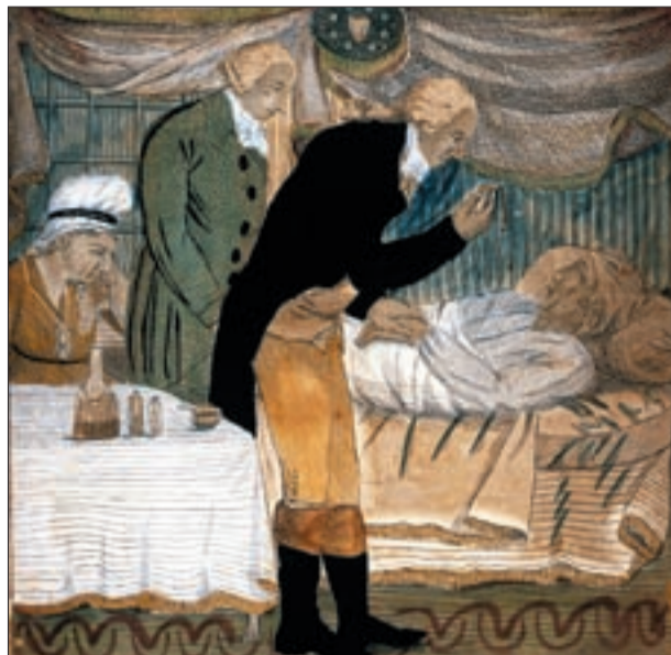
George Washington in His Last Illness, an etching done in 1800 by an unidentified artist, is an example of the public's fascination with the death of its first American hero.

Even though Washington's doctors did a lot of things that modern doctors would not do, they tried very hard to help him. They used medical practices that were believed to be the most helpful. Washington knew that he was very ill. He died bravely.