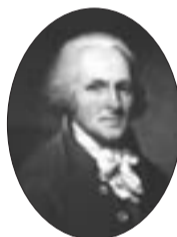
Charles Wilson Peale, self-portrait, oil on canvas, circa 1791. National Portrait Gallery, Smithsonian Institution

fourth of a dollar, if only to see the huge American buffalo. Peale's rooms are filled with monsters of the earth and sea, a rich array of birds, and a great collection of the bones, jaws, and teeth of tigers, sharks, and many other fearful animals. In one room are rattle, black, and spotted snakes, confined in cases enclosed with wire and glass. She was astonished to see Mr. Peale take out a black snake about four or five feet long, which he permitted to touch his cheek and twine itself around his neck. In the yard and stable were eagles, owls, baboons, monkeys, and a six-footed cow. Mr. Peale is also a painter, and there can be seen in his museum more than a hundred portraits of the more noteworthy personages of our country, including our illustrious Washington.