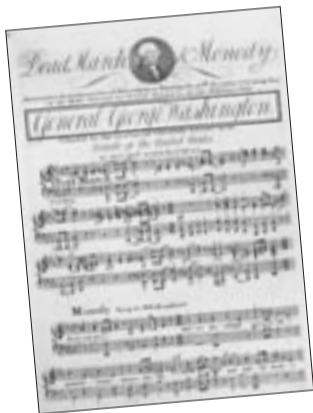
"Death March and Monody," sheet music, circa 1799-1800.

MRS. WASHINGTON'S DRAWING ROOM. On Friday evening at eight, your humble correspondent was among the ladies and gentlemen in attendance at Mrs. Washington's weekly reception. Mrs. Washington, plainly dressed, but in a gown of rich silk, sat on a sofa by the fireplace and arose to greet her guests with a curtsy which each lady returned. Each gentleman bowed low. Coffee, tea, and cake were served, and had I come in the summer, I would have been offered lemonade and ice cream. The ladies swish about, and as candlelight is a great improver of beauty, they appear to great advantage. President Washington circulated among the crowd, chatting agreeably with all the ladies. It is said that he keeps count of the numbers who come to pay their respects to Mrs. Washington and was pleased to find the room so crowded.