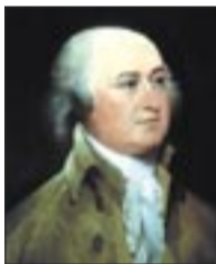
John Adams by John Trumbull (detail), oil on canvas, circa 1793. National Portrait Gallery, Smithsonian Institution

WHAT IS THE PRESIDENT TO BE CALLED? Debate, we are told, rages behind the closed doors of the Senate over a proper title for the President. Vice President John Adams and a number of the senators have insisted that a grand and high-sounding name, such as “Elective Excellency” or “Elective Highness,” is necessary to give respect to the office. Sources tell us that the committee appointed to draw up a list of titles “of all the Princes of the Earth” has recommended “His Highness the President of the United States of America, and Protector of their Liberties.” But the House of Representatives refuses to agree, and Mr. Washington will be simply called President of the United States. As one member of Congress told us, no other title was necessary to add to the respect the whole country had