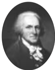
Charles Wilson Peale, self-portrait, oil on canvas, circa 1791.