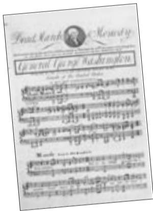
"Death March and Monody," sheet music, circa 1799-1800.

MRS. WASHINGTON'S DRAWING ROOM. On Friday evening at eight, your humble correspondent was among the ladies and gentlemen in attendance at Mrs. Washington's weekly reception. Mrs. Washington, plainly dressed, but in a gown of rich silk, sat on a sofa by the fireplace and arose to greet her guests with a curtsy which each lady returned. Each gentleman bowed low. Coffee, tea, and cake were served, and had I come in the summer, I would have been offered lemonade and ice cream. The ladies swish about, and as candlelight is a great improver of beauty, they appear to great advantage. President Washington circulated among the crowd, chatting agreeably with all the ladies. It is said that he keeps count of the numbers who come to pay their respects to Mrs. Washington and was pleased to find the room so crowded.