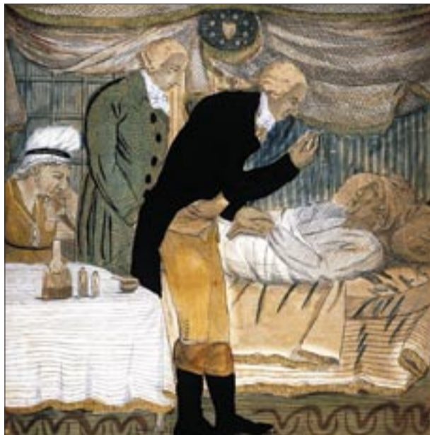
George Washington in His Last Illness, an etching done in 1800 by an unidentified artist, is an example of the public's fascination with the death of its first American hero.

During his whole illness he spoke but seldom, and with great difficulty; and in so low and broken a voice as at times hardly to be understood. His patience, fortitude, and resignation