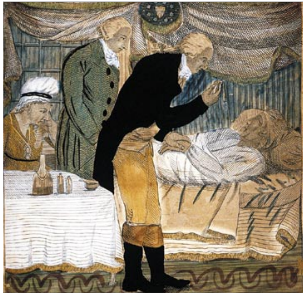
George Washington in His Last Illness, an etching done in 1800 by an unidentified artist, is an example of the public's fascination with the death of its first American hero.

Even though Washington's doctors did a lot of things that modern doctors would not do, they tried very hard to help him. They used medical practices that were believed to be the most helpful. Washington knew that he was very ill. He died bravely.