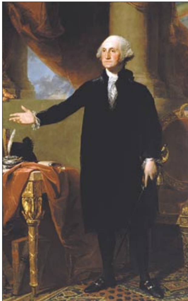
The National Portrait Gallery, Smithsonian Institution, acquired Gilbert Stuart's 1796 Lansdowne portrait of George Washington in 2001 as a gift to the nation through the generosity of the Donald W. Reynolds Foundation.

Next they were off to the show at George Elementary School. President Washington called for volunteers and taught the kids how to bow, curtsy, dance the minuet, and plow a field.