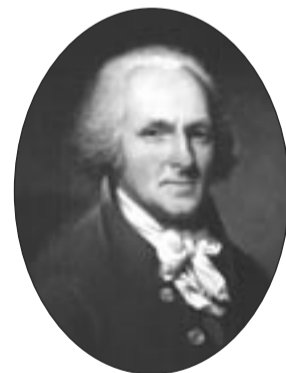
Charles Willson Peale, self-portrait, oil on canvas, circa 1791.

buffalo. Peale's rooms are filled with monsters of the earth and sea, a rich array of birds, and a great collection of the bones, jaws, and teeth of tigers, sharks, and many other fearful animals. In one room are rattle, black, and spotted snakes, confined in cases enclosed with wire and glass. She was astonished to see Mr. Peale take out a black snake about four or five feet long, which he permitted to touch his cheek and twine itself around his neck. In the yard and stable were eagles, owls, baboons, monkeys, and a six-footed cow. Mr. Peale is also a painter, and there can be seen in his museum more than a hundred portraits of the more noteworthy personages of our country, including our illustrious Washington.