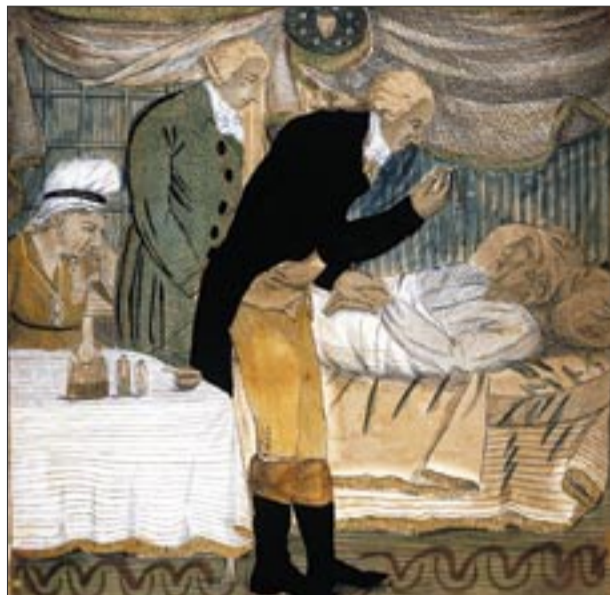
George Washington in His Last Illness, an etching done in 1800 by an unidentified artist, is an example of the public's fascination with the death of its first American hero.

Even though Washington's doctors did a lot of things that modern doctors would not do, they tried very hard to help him. They used medical practices that were believed to be the most helpful. Washington knew that he was very ill. He died bravely.