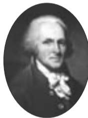
Charles Wilson Peale, self-portrait, oil on canvas, circa 1791. National Portrait Gallery, Smithsonian Institution

fourth of a dollar, if only to see the huge American buffalo. Peale's rooms are filled with monsters of the earth and sea, a rich array of birds, and a great collection of the bones, jaws, and teeth of tigers, sharks, and many other fearful animals. In one room are rattle, black, and spotted snakes, confined in cases enclosed with wire and glass. She was astonished to see Mr. Peale take out a black snake about four or five feet long, which he permitted to touch his cheek and twine itself around his neck. In the yard and stable were eagles, owls, baboons, monkeys, and a six-footed cow. Mr. Peale is also a painter, and there can be seen in his museum more than a hundred portraits of the more noteworthy personages of our country, including our illustrious Washington.