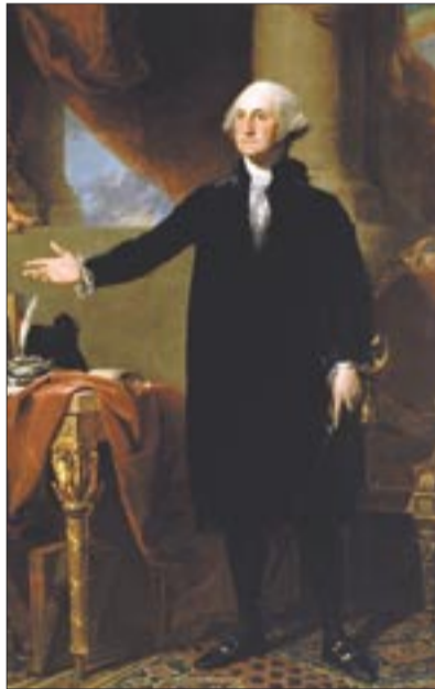
The National Portrait Gallery, Smithsonian Institution, acquired Gilbert Stuart's 1796 Lansdowne portrait of George Washington in 2001 as a gift to the nation through the generosity of the Donald W. Reynolds Foundation.

Next they were off to the show at George Elementary School. President Washington called for volunteers and taught the kids how to