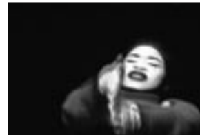
Billy's buddies help "Pledge It Forward" through flight, fantasy, and fun